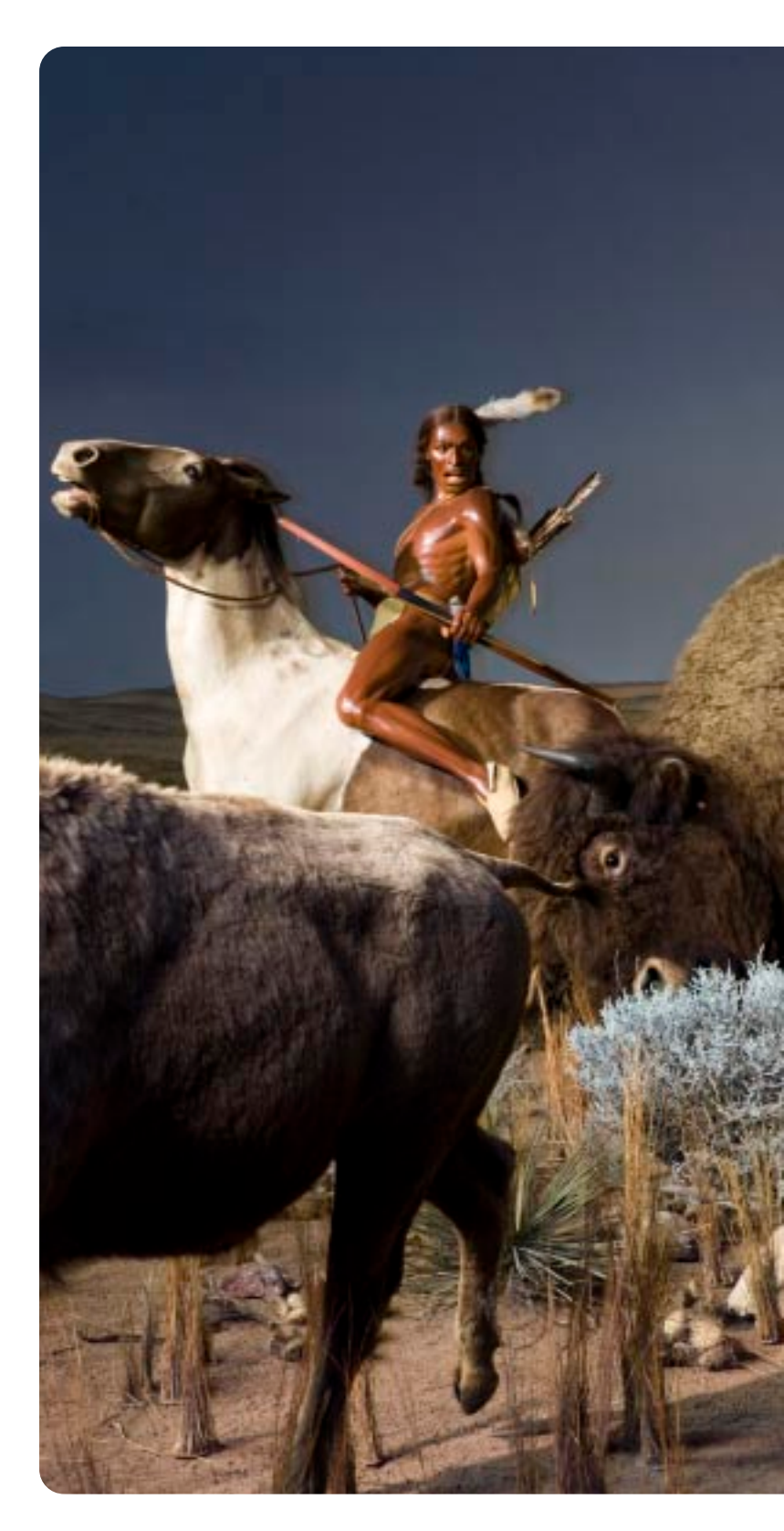
Exhibit staff members participated in behind-the-scenes tours for visiting school groups, docents, exhibit sponsors, the media and visiting professionals from other museums. They also created displays and thematic environments for public programs and special events, and installed holiday displays and decorations throughout the Museum.